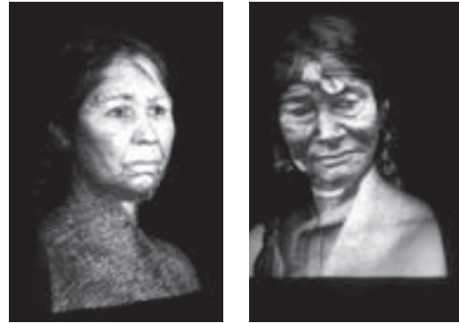
MERYL MCMASTER, Ancestral 6, 1,8 , each 101 cm x 76 cm digital c-prints, 2008

similarly themed websites) collect the unintentionally hilarious interactions that sometimes take place in this social sphere. The backlash has now occurred when people who suddenly find themselves with a worldwide audience for their least flattering moments can take on their critics in the comment section of Lamebook creating a feedback loop of potentially troll-like behavior. Look at what sharing has done to us now.