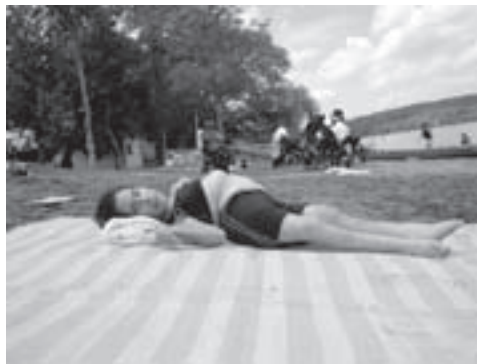
CHRISTOPHE JIVRAJ, Giota from the series Camp , 76.2 cm x 101.6 cm c-print, 2006